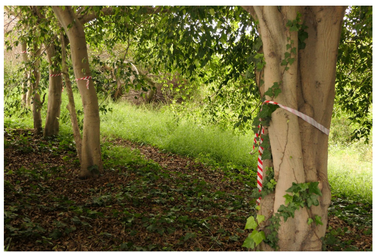
Figure 5. Showing candy-striped flagging tied around the trunks of several ficus trees that should be preserved in place until the Allen's Hummingbird nest fledges.