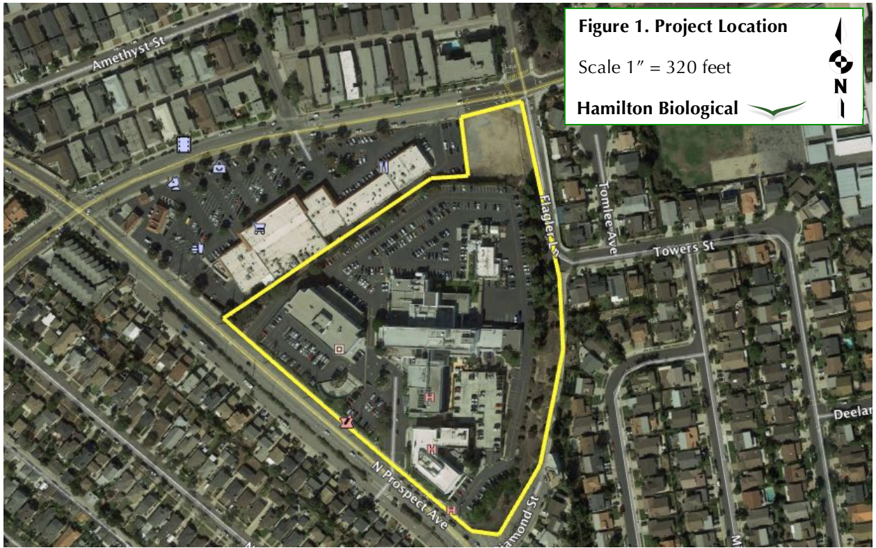
Figure 1. The Beach Cities Health District campus is located at 514 N. Prospect Avenue in Redondo Beach, CA. The biological survey covered the entire campus. Surrounding land uses are urban.

At your request, Hamilton Biological, Inc., has conducted a biological evaluation of the 11-acre Beach Cities Health District project site, in the City of Redondo Beach (Figure 1). The proposed project involves redevelopment of the site, which is fully developed. This report provides the methods and results of my survey, and discusses environmental regulations that may be relevant to implementation of the proposed project.