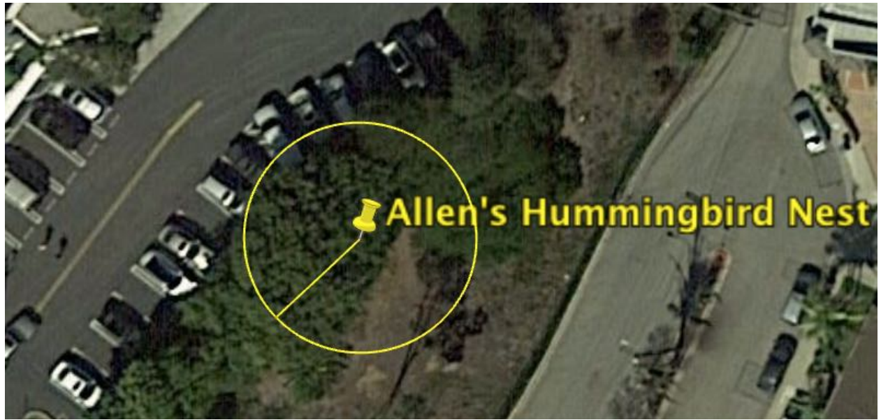
Figure 4. Showing a 30-foot buffer around the nest location, where no project activities should occur until the nest has fledged. See also Figure 5.